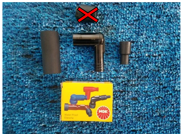
Fig (3) Replacement Parts, item with red X included in kit but is not required and may be discarded.