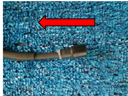
Fig (8) Run Base Cover over end, arrow indicates direction.