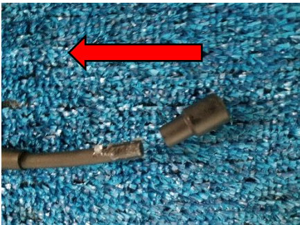
Fig (7) Add grease and run Base Cover over end, arrow indicates direction.