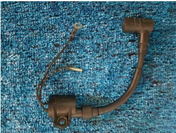
Fig (1) Stock Ignition coil, wire, and factory plug boot.