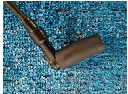
Fig (15) Cover should marry against 90° bend.