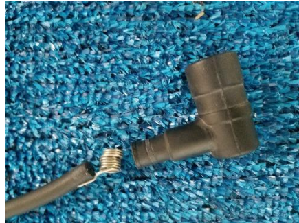
Fig (5) Boot separated from wire exposing coil.