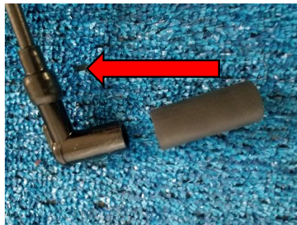
Fig (14) Place Plug Cover over boot. Arrow indicates direction.