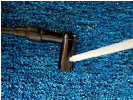
Fig (13) Light coat with grease.