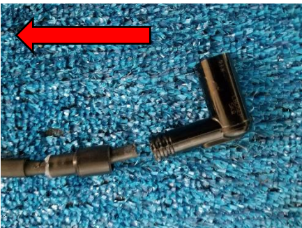
Fig (10) Place over wire and twist clockwise to tighten. Arrow indicates direction.