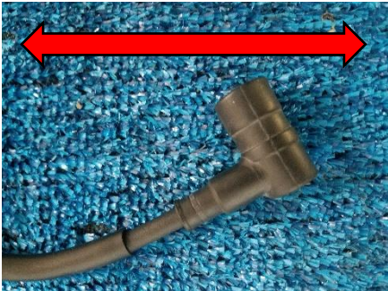
Fig (4) Firmly grasp wire and boot and pull in opposite directions, removing boot.