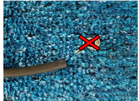
Fig (6) Remove coil from wire and dispose.