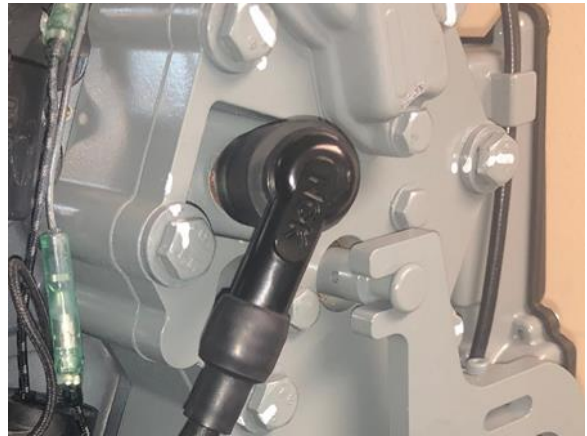
Fig (2) NGK Plug Boot installed.