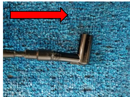
Fig (11) Plug Boot firmly seated on wire. Slide Base Cover over Plug Boot base. Arrow indicates direction.