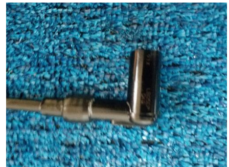
Fig (12) Base Cover in place over Plug Boot base.